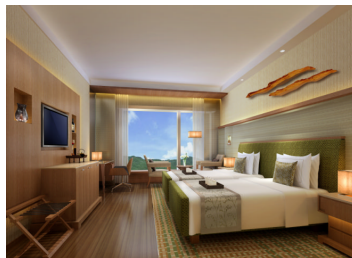
Guest Room (Deluxe Room)