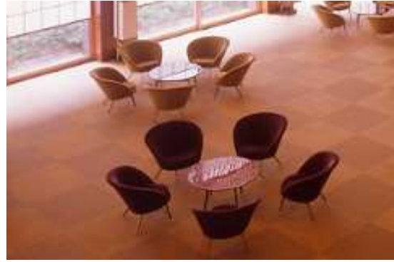
Lacquered tables and chairs