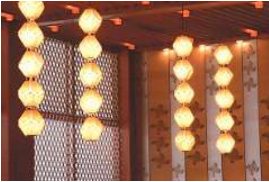
Okura Lantern ceiling lights