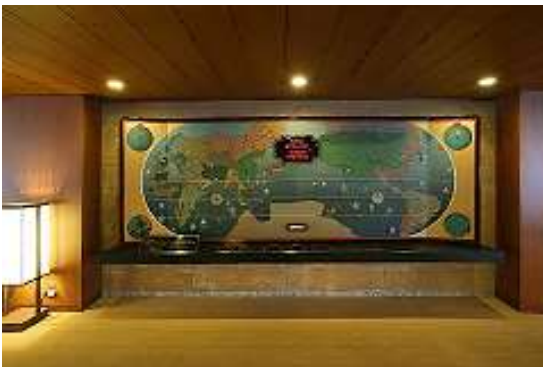
World map and clock displaying global time zones