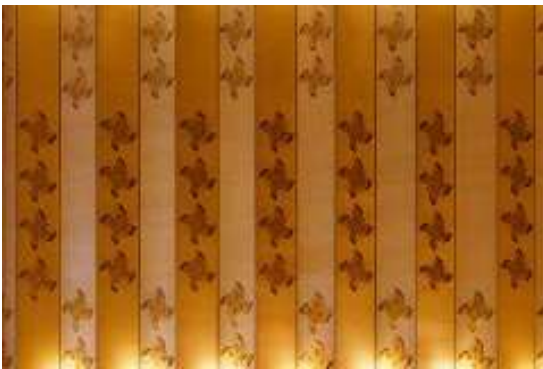
Hanging wall tapestry Four Petal Flowers